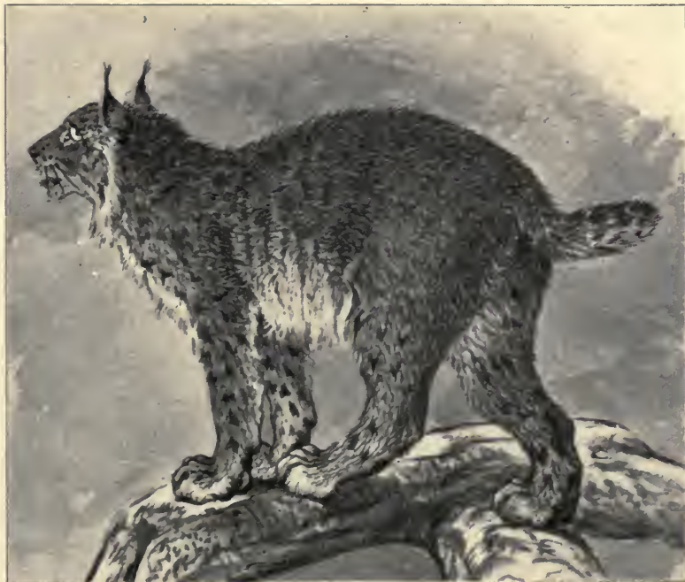
FIG. XLII. FELIS R. BAILEY. BAILEY'S LYNX.